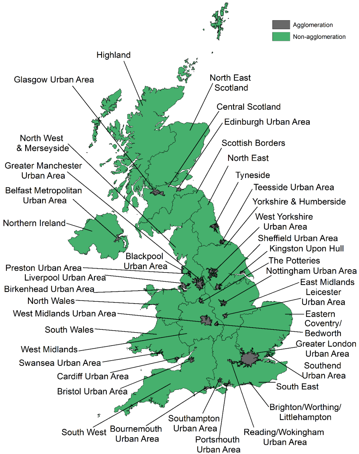
Figure 2.1 UK Zones for Ambient Air Quality Reporting 2023

© Crown copyright. All rights reserved Defra, Licence number 100022861 [2023]