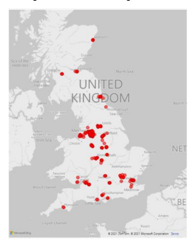
Figure 3-2 UUNN Monitoring Locations

monitoring data for validating monitored NO<sub>2</sub> concentrations. Figure 3-2 provides a map of the UUNN monitoring locations.